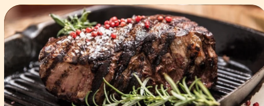
3 Course Plated $84 pp | Min. 20 pax