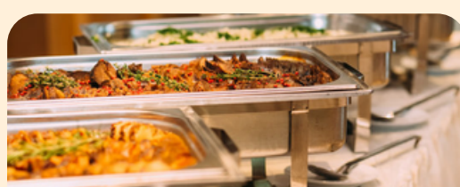
Premium Golf Grill $68 pp | Min. 20 pax