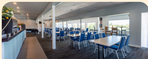
Park View Bar $795 | Up to 120

Select your location, food and drinks for after your event to keep the good times swinging. Full functions pack with more spaces and food options are available for viewing upon request. All food is halal and we cater to all dietaries.