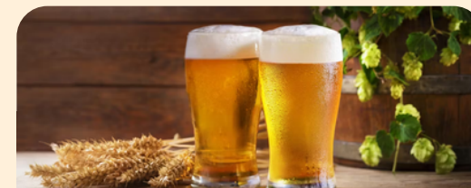
Signature Drinks From $29pp for 1 hour