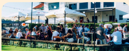
Patio Terrace $350 | Up to 80