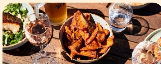
Party Food $30 pp | Min. 15 pax