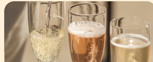
Deluxe Drinks From $39pp for 1 hour