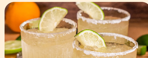
Ultimate Drinks From $45pp for 1 hour